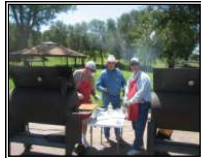
Sponsor's cooking for Golfers!