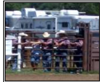
West Texas A&M student volunteers