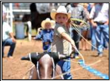
Kids Dummy Roping