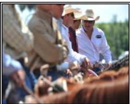
Getting ready for "Short Round Sunday"